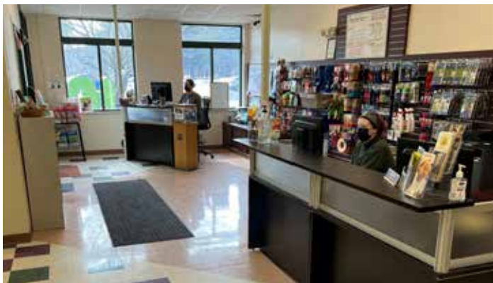
DCHS's Adoption Center