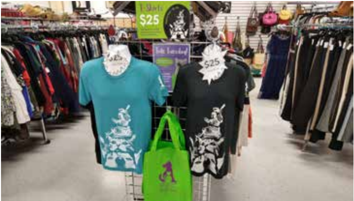
Inside DCHS’s Thrift Store

“I didn’t think I would like volunteering at the Thrift