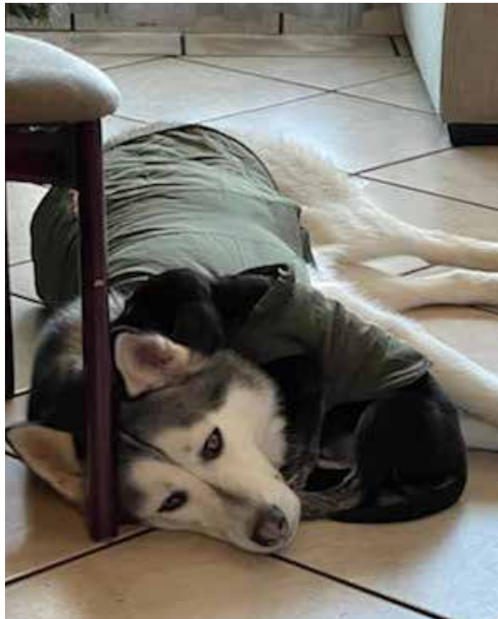
Morphy and Rocky take a snooze after playtime