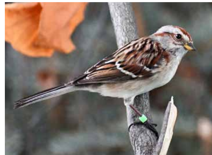
The American tree sparrow