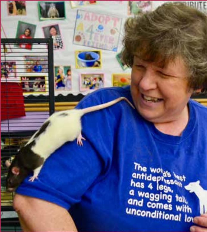
Holly with a classroom rat

DCHS is a private, community-supported non-profit that