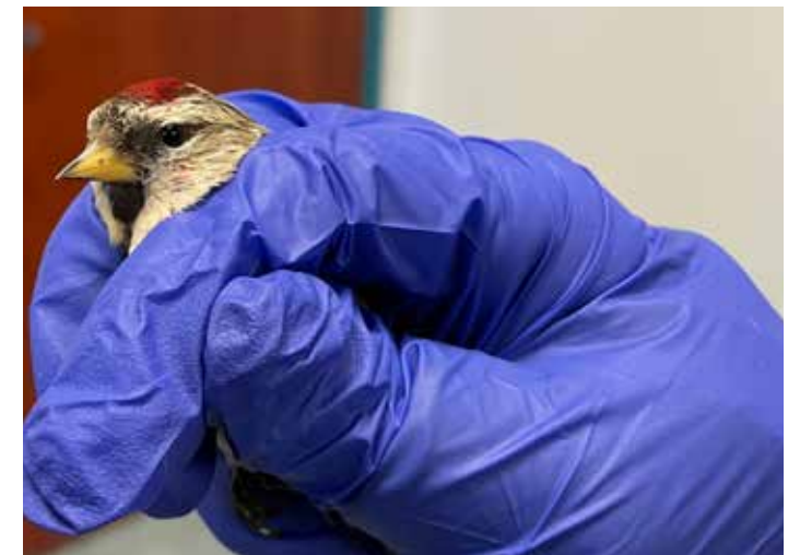
The common redpoll