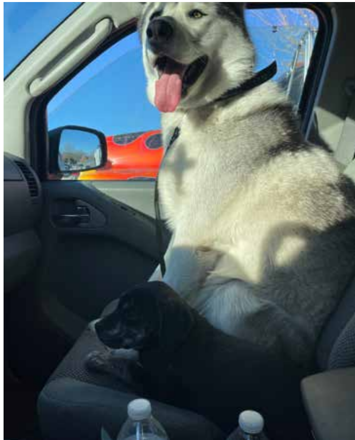
Morphy and Rocky ride home together