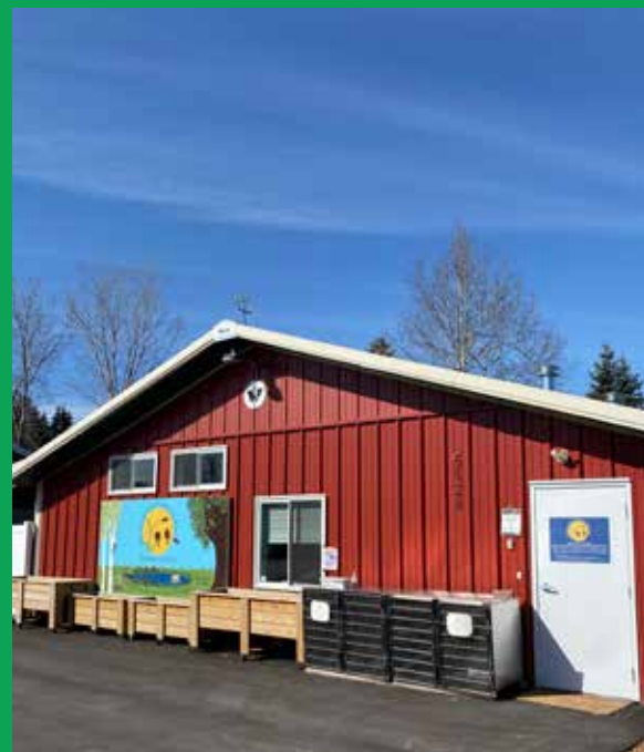
DCHS's Wildlife Center

Dane County Humane Society (DCHS)'s Wildlife Center was founded in 2002 and has grown to be the third-largest wildlife rehabilitation center in Wisconsin . Our mission is to promote the health and welfare of wildlife through rehabilitation, professional training, and public education. The Wildlife Center is coordinated by six full-time licensed staff, one part-time veterinary technician, one annual apprentice, and approximately 20 interns. With help from over 150 volunteers, our team works together to help the thousands of sick, injured, or orphaned wild animals admitted to the Wildlife Center each year. We're entering our 20th year in operation and are excited to celebrate this milestone with our supporters!